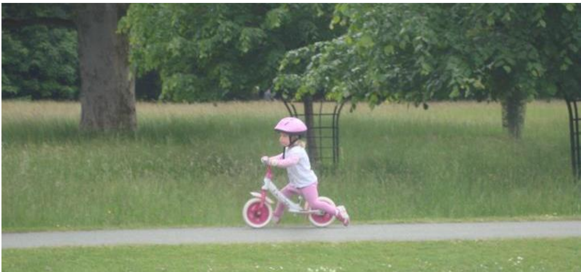
Image 1: All ages and abilities should be able to cycle safely in company, and the 8-80 age cohort should be able to cycle safely independently

It is good to see that the bye-law public consultation was included on the Council's website, a variety of media and on www.speedlimits.ie