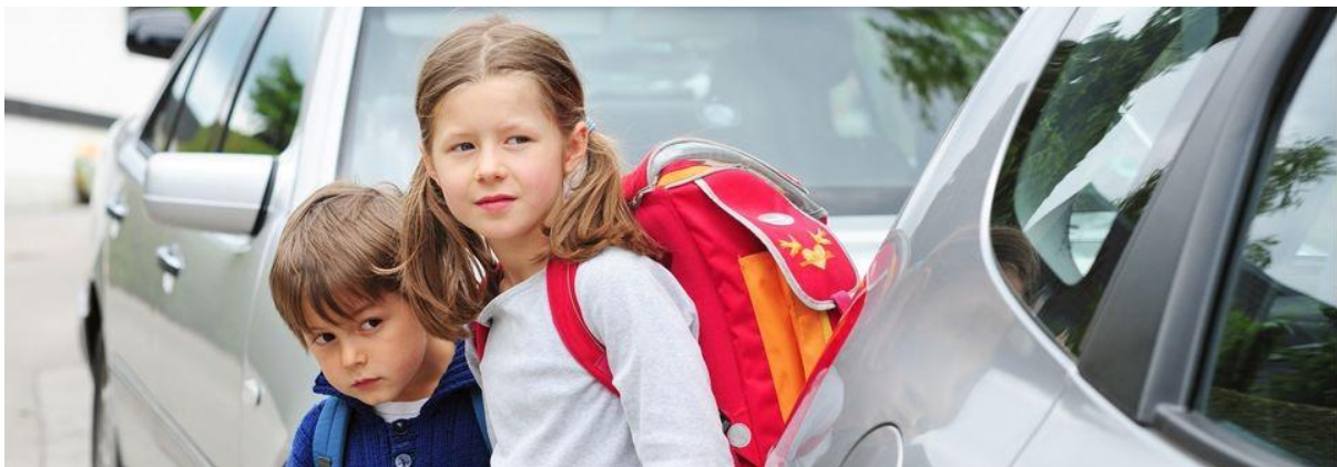
Image 2: Children should be able to walk to and from school, play in their neighbourhood, visit grandparents, and go to the local shop.